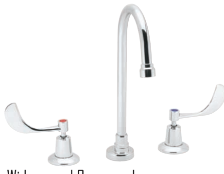
Widespread Gooseneck Series