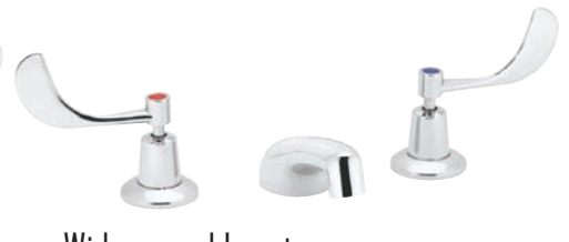
Widespread Lavatory Series

REQUEST OPTION "CA" FOR CALIFORNIA LOW LEAD PRODUCTS