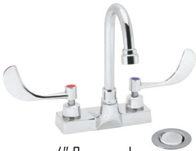
4" Gooseneck Series