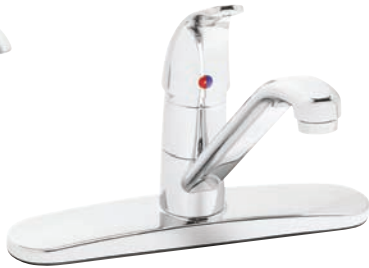
8" Single Lever Kitchen Series