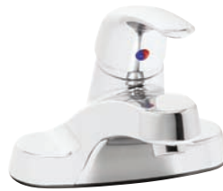
4" Single Lever Series