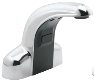
4" Sensor Faucet Series

Speakman has already re-engineered most of our commercial plumbing products to comply with CA AB 1953 with plans to complete the transition for all required products by the end of 2009. The re-engineered products retain the same specification quality you expect from Speakman products.